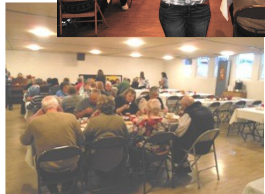
Roast Beef Dinner