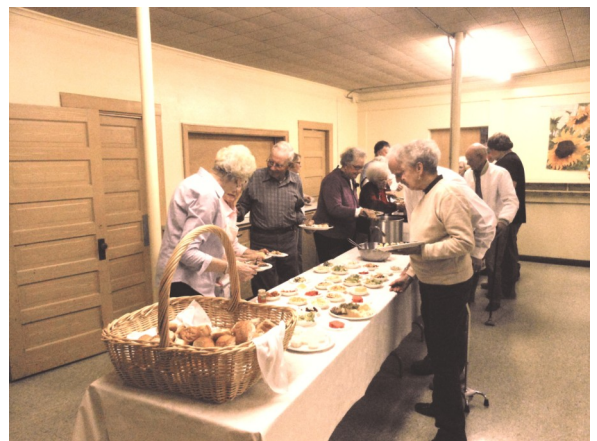
Roast Beef Dinner