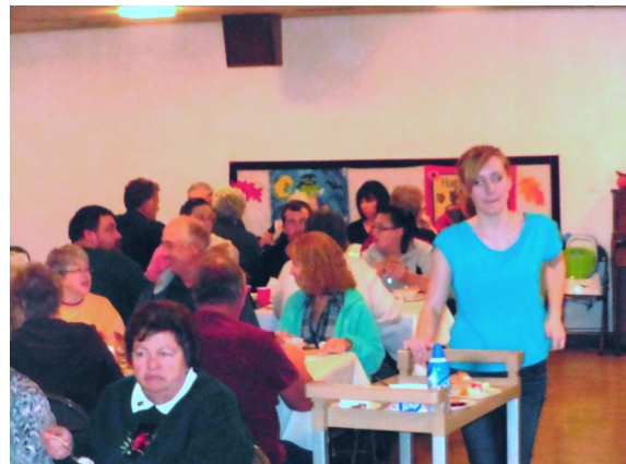
Roast Beef Dinner

UMW's monthly meeting will be Nov. 20th at 7:30 PM. We hope to see you there — the more who come, the more interesting and enjoyable our meetings!