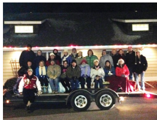
The 2014 Ride

There will be a sign-up sheet on the Fireside room bulletin board, for you to sign, or give us a call, if you plan to attend. We can estimate the number of carolers to serve chili and other goodies after we finish the hayride and caroling!