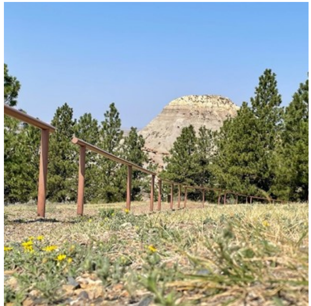
Makoshika State Park near the amphitheater