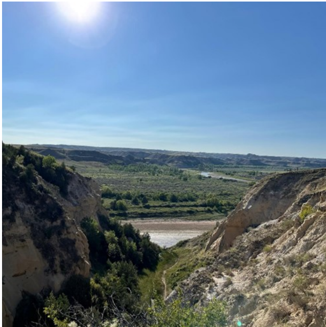
Theodore Roosevelt National Park

You will find more information on the upcoming events in this newsletter and in the coming weeks, I will announce much more of our programming year as we attempt to provide more programming for all of our age groups this church year. Look for updates on youth and children events and Sunday School, Bible Studies both online and in person, fundraisers, community building, and much, much more! Philippians 3:12 (CEB) It's not that I have already reached this goal or have already been perfected, but I pursue it, so that I may grab hold of it because Christ grabbed hold of me for just this purpose. Let's us press onward in the Gospel of Jesus Christ!